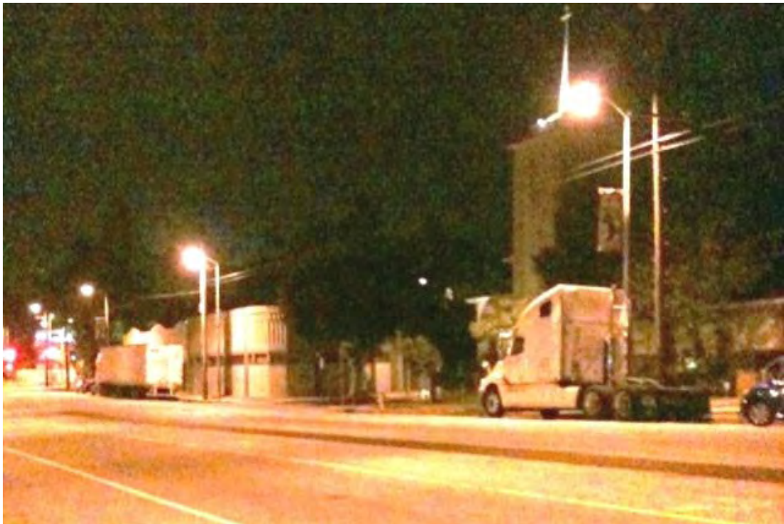
Overnight semi truck and trailers parked near Via Marisol & Monterey