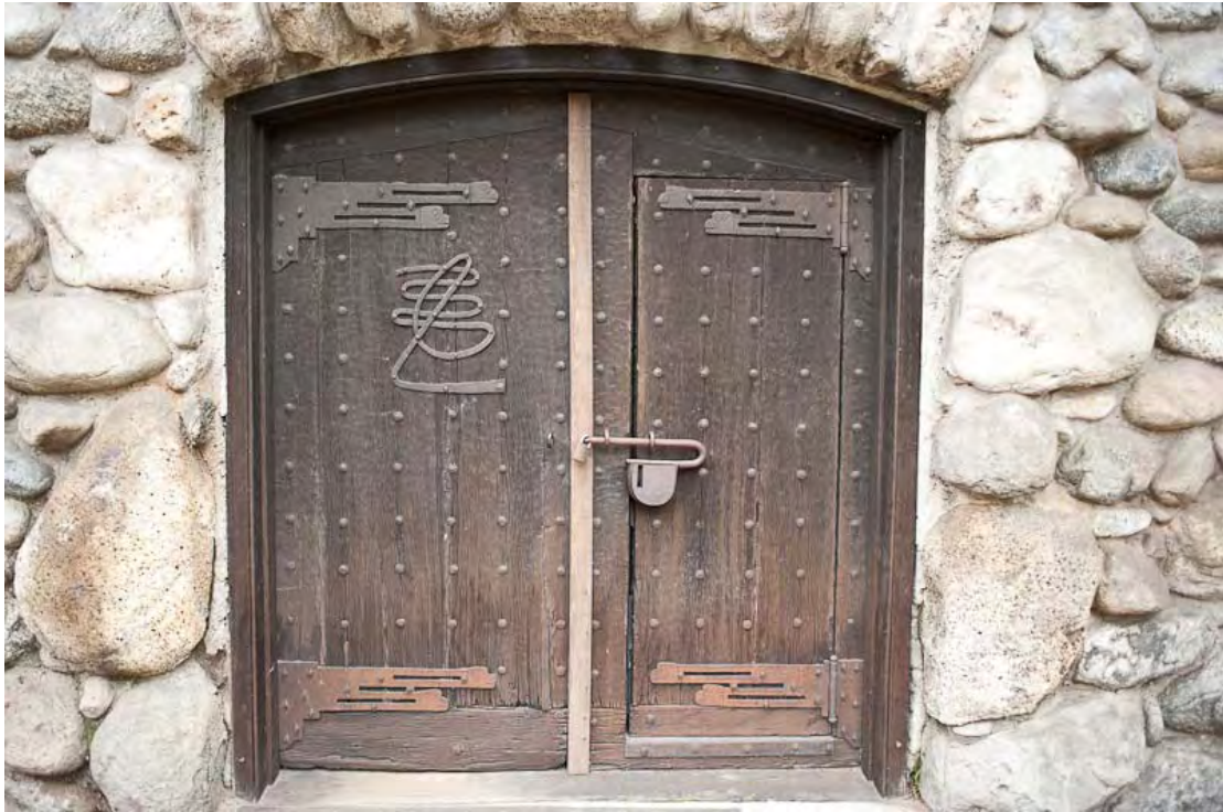
Lummis Home entry doors